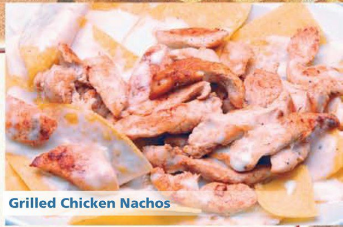
Grilled Chicken Nachos